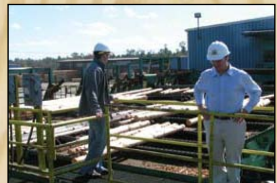
Logs are sorted prior to entering the mill