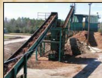
Nothing from the log is wasted