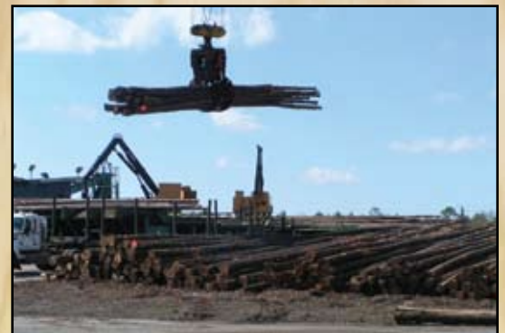
The Log Deck