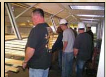
The Grading Line