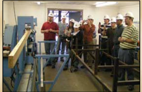
Machine Stress Rating (MSR) Testing